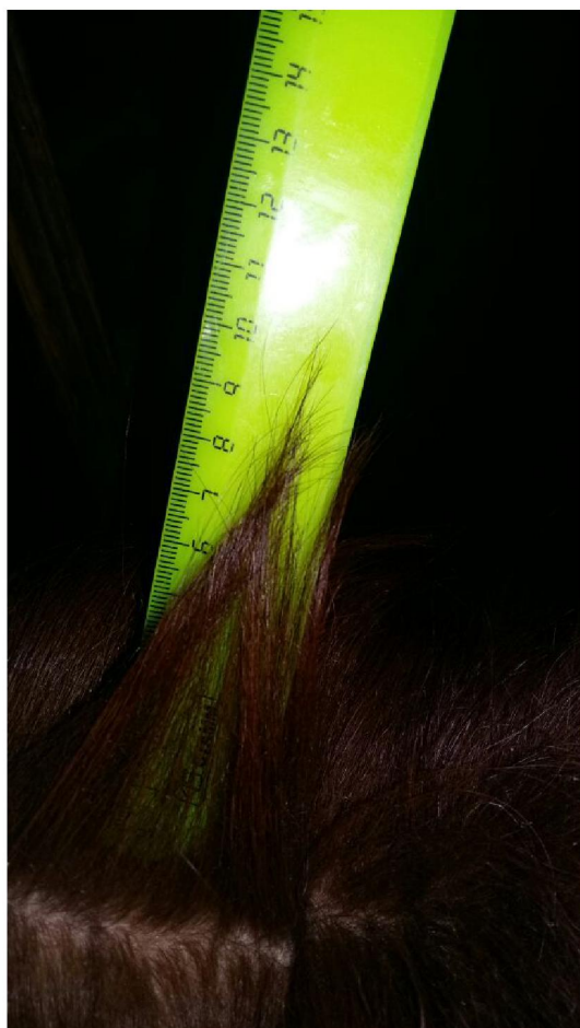
Figure 2 – Hair length in winter