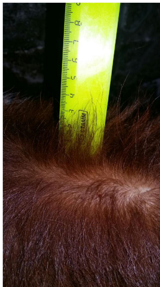
Figure 3 – Length of hair in summer