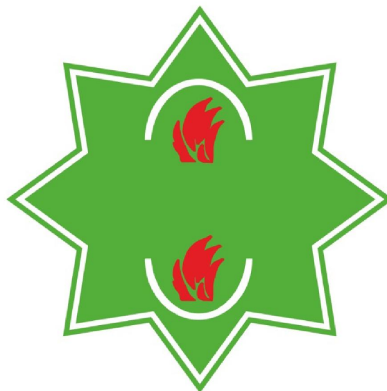
Picture 4 – Graphic reconstruction of the national emblems of veterinary medicine in the traditional Kazakh society

Description of the claimed designation in figure 3: the color pictorial sign consists of two main elements and is presented in the form of a fiery solar symbol - a genuine Kazakh eight – beam star of bright blue color, framed at the edges and perimeter by a narrow white strip. In the center of the eight-pointed star, two bright scarlet flames are located above each other and on one vertical line, each of which is framed by an white arc; according to the description, nomads, coming back from wintering, move with the cattle between the two fires, performing the rite of purification – alastau (synonymous with hygiene); bright blue color of the star is associated with tranquility and clear sky.