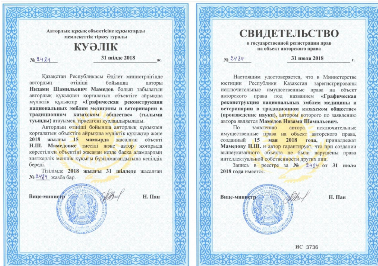
Picture 5 – Copy of certificate No. 2484 on state registration of rights to the object of copyright, dated on the 31 st July, 2018