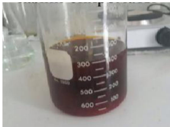
Figure 2 – Solution of potassium bicarbonate conversion method in sulfuric acid