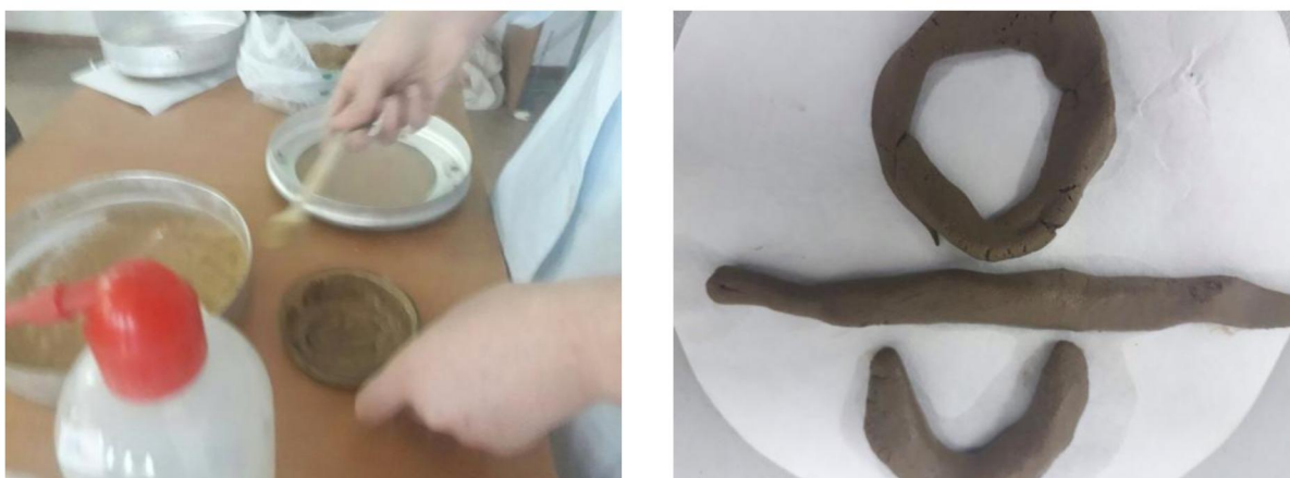
Figure 4 – Soil sample necessary to detect mechanical composition by the wet method

A conclusion about the mechanical composition of the soil is made based on the shape of the threads and rings (figure 4).