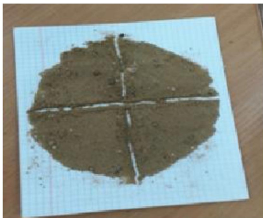
Figure 1 – Preparing the soil sample

The humus of the soil samples tested by airborne soil conversion method (figure 1-3) is based on the oxidation in the solution of potassium bicarbonate in sulfuric acid.