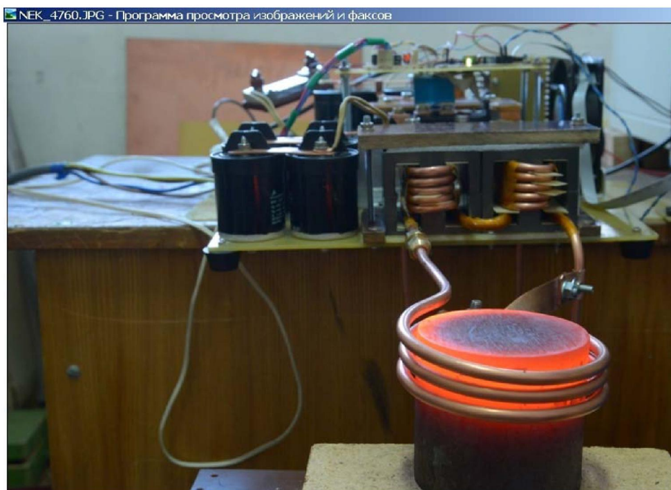
Figure 3 – Process of induction surface heating of metal with a 120 mm diameter at a frequency of 20 kHz

A prototype of a frequency converter was developed and manufactured. Figure 3 shows a prototype of a frequency converter with a power of 6 kW at frequencies from 2 to 20 kHz. In the frequency converter, the source is a three-phase 380 V power system, of industrial frequency. The frequency converter is implemented on IGBT transistors. The control system is implemented on the logical elements of the mathematical apparatus of the software complex. The rectifier was made on the basis of a bridge with a six-pulse rectification circuit. To match the voltage and galvanic isolation, a double-wound high-frequency power transformer was used.