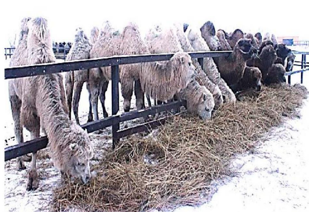
Figure 1 – Camels on the LAIDOYA farm in winter