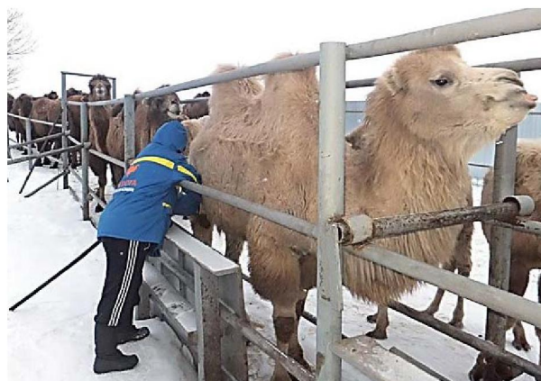
Figure 2 – Milking of camels on the LAIDOYA farm

To measure contents of moisture and dry substances in dairy products, a gravimetric method was used (drying up to constant weight at a temperature of 102 \pm 2 °C) according to GOST 3626-73.