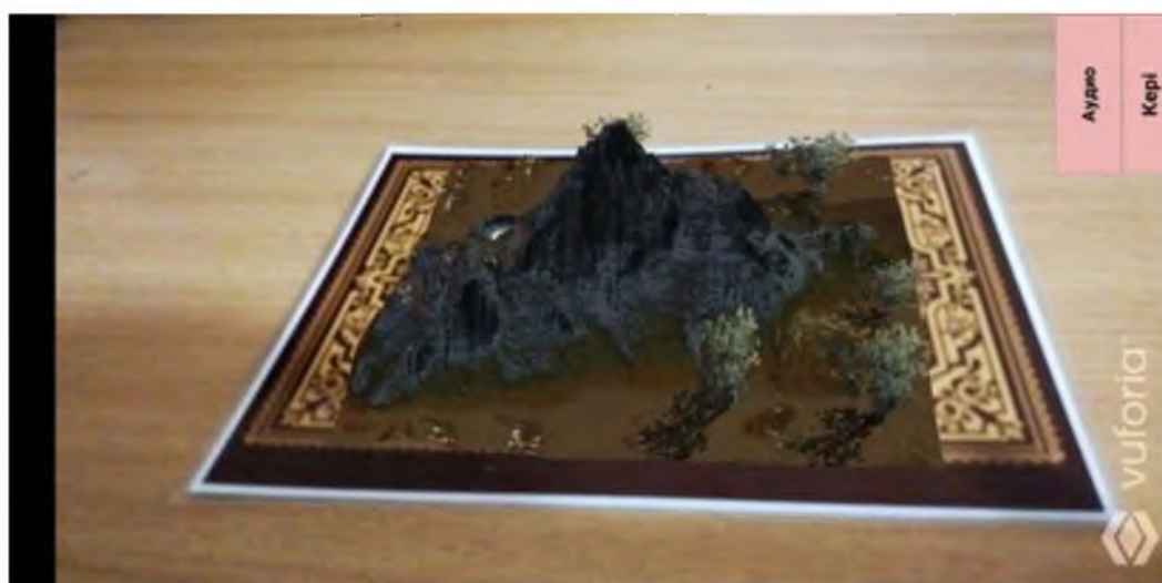
Figure 2 – Augmented reality for Abay Kunanbayev's translation «Mountain peaks sleep in the darkness of the night...»

Augmented reality for poems is developed on the Vuforia platform. Vuforia is an augmented reality platform and Toolkit for developing augmented reality software for mobile devices developed by Qualcomm. Vuforia uses computer vision technologies, as well as tracking flat images and simple three-dimensional real objects in real time.