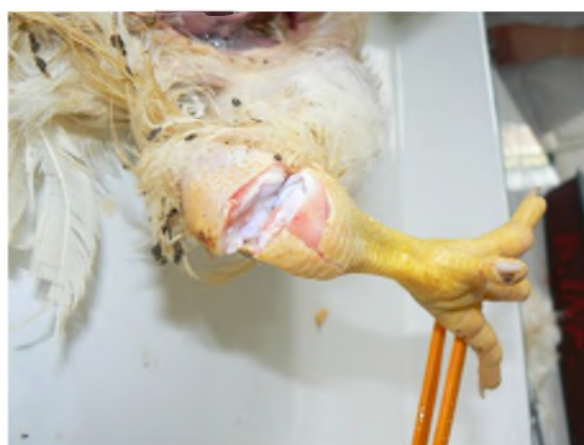
Figure 2 – Inflammation of the synovial sheaths

The results of this exam, made by ELISA test, are shown in table and figure 3. After the interpretation of reactions and the processing of results, according to the interpretation soft of the FlockChek ® Avian MS Antibody Test Kit, there were assigned for every recoltation: the titre group, the minimum titre, the maximal titre and the geometrical mean (G.M.). The titers are expressed in optical densities (O.D.).