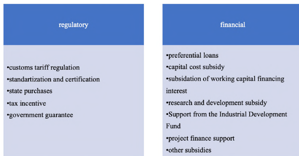
Figure 1 – The main measures to support import substitution in Russia. Note: developed by the authors on the basis of Internet resources

In order to increase the availability of borrowed resources for agricultural producers in 2018, the following government support measures were implemented in the framework of the project “Promoting Investment Activities in the Agro-Industrial Complex”: