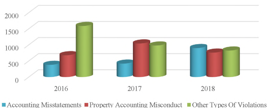
Figure 3 – Dynamics of the amounts of violations according to the results of the audit activities of the National Audit Office for 2016-2018. Note: compiled by the author based on the source [5]

Private experts and universities conduct external reviews of the Office reports and statements. A special structural unit of the SAI carries out internal expertise. Only 10% of the total number of control measures undergo examination by internal control.