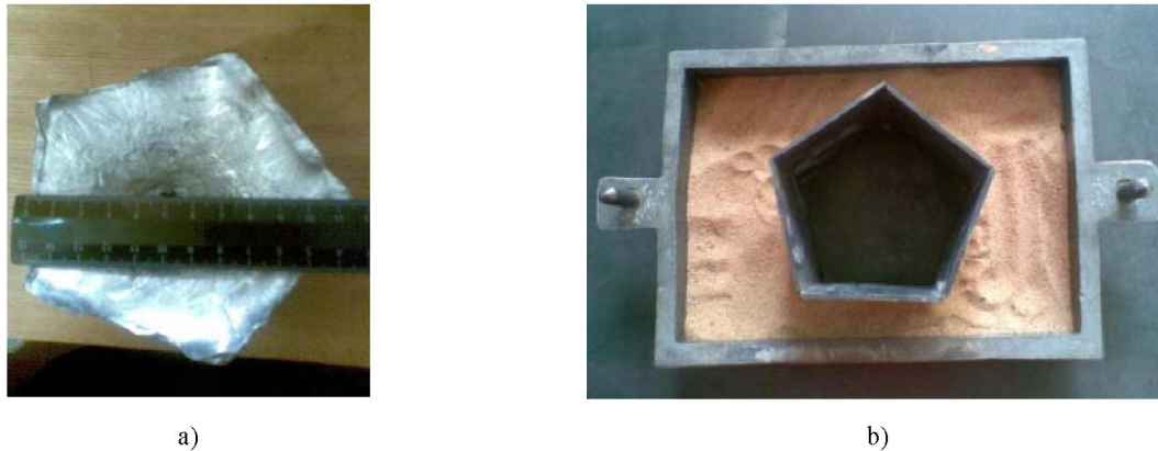
Figure 1 – Pentagonal casting ( a ) and mold ( b )

Experimental research and discussion of the results. The current paper presents the results of an experiment to obtain a casting in a mold of a pentagonal cross section, a physical system for creating a controlled heat flux (figure 1 a, b ).