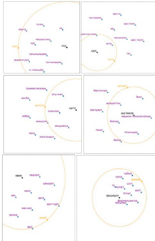
Figure 2 - Graphical representation of the vector space of practical results of the semantic analysis of the text in the Kazakh language