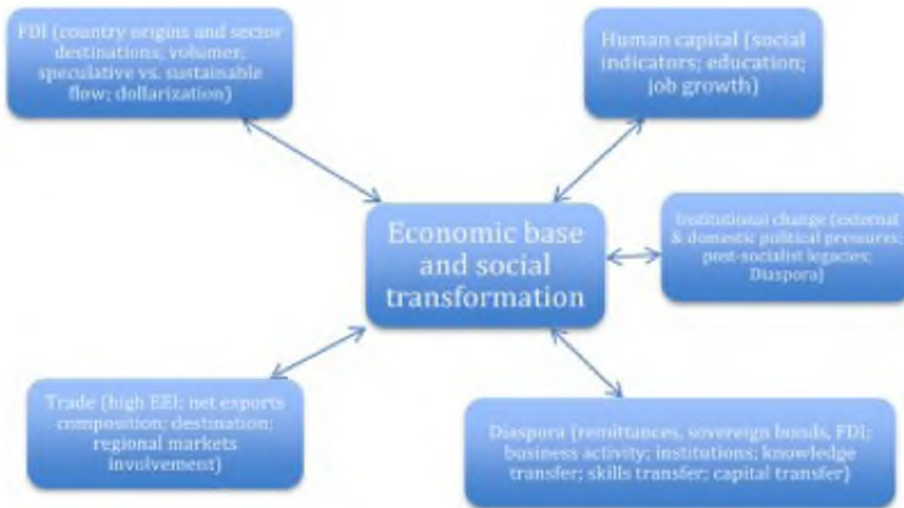
Figure 1 – Five forces of economic and social transformation

Foreign firms managers are suited to gain if acquire local context and local (or Diaspora-) based partner (public or private) prior to regional or standalone entry. Despite multiple headwinds, both economies retain strong international business potential and hope for an economic and social resurrection.