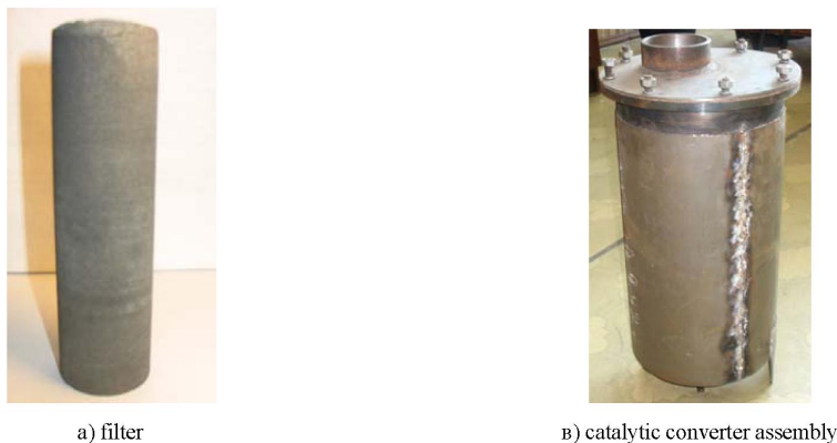
Figure 1 – The design of the filter

The duration of the measurement of fuel consumption was not less than 30 seconds. The measurements of opacity, toxicity, temperature and pressure of the exhaust gas were made at least six times for each of the modes using similar devices through the distribution column.